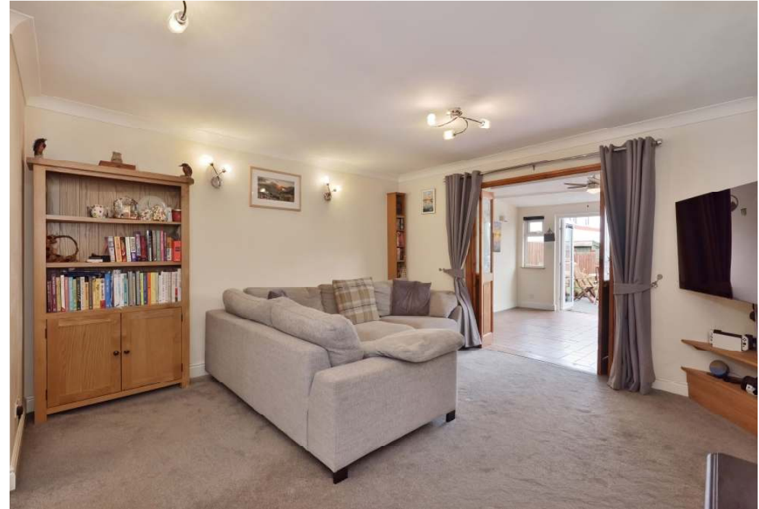
Kitchen / Living/Dining Room / one of two bedrooms and supporting bathroom